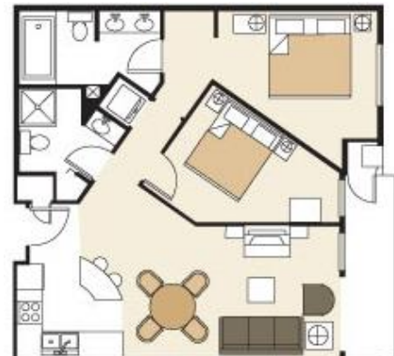
Two Bedroom Two Bath KING Suite 1 King / 1 Queen / 1 Sofa Sleeper

Rates are valid for up to four adults. Any additional adults will be $20 plus tax per night.