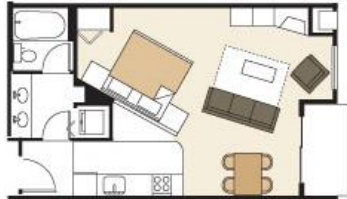
Studio/JUNIOR Suite 1 Queen / 1 Sofa Sleeper

All our suites include a full kitchen with utensils, dining table, electric fireplace, washer & dryer, jetted tub, air conditioning, cable TV, hair dryer, iron, ironing board.